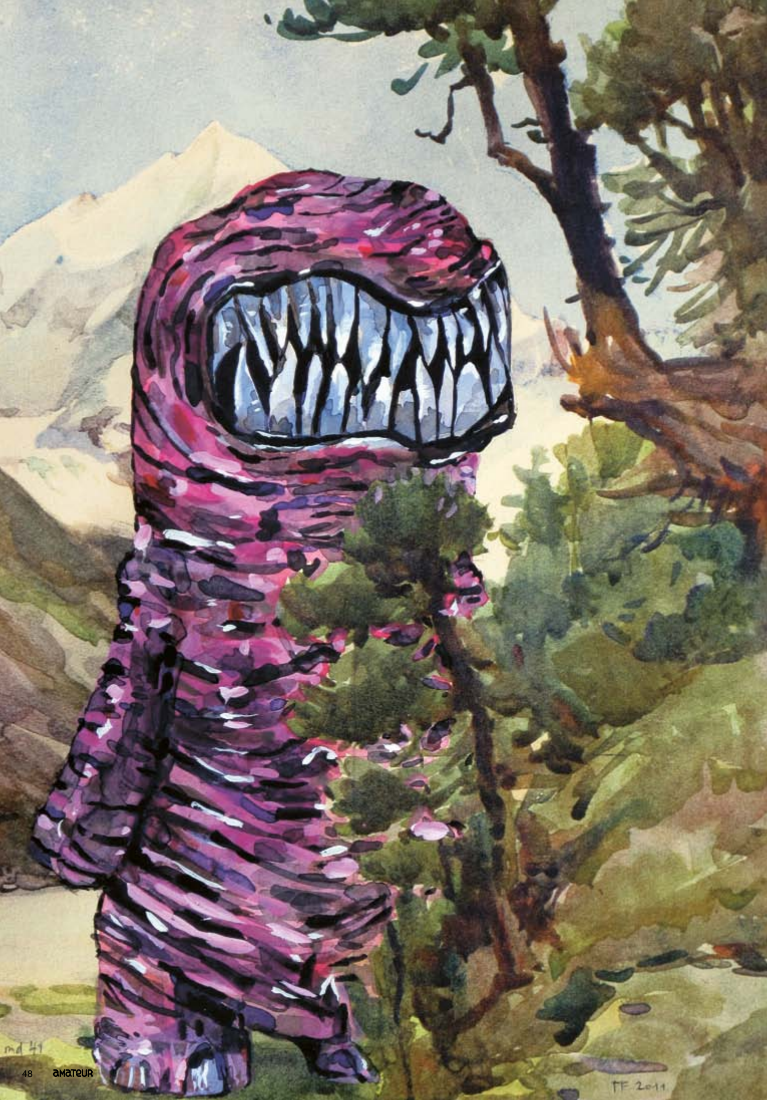
Monster Drawings 41 (Val Rosegl), 2011, 30 x 21 cm, pencil, watercolor, gouache, ink on reproduction