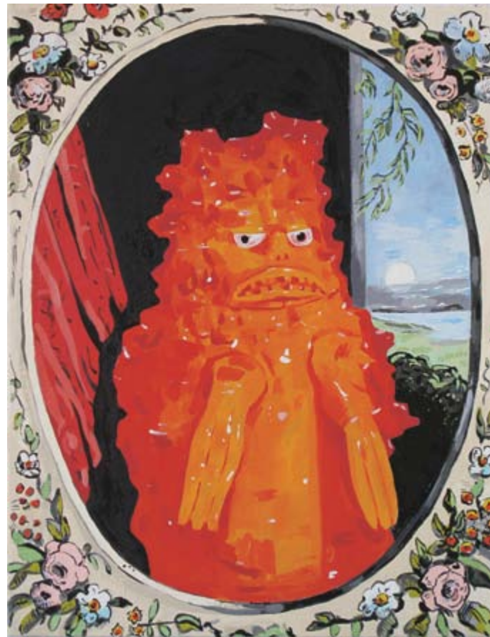
Monster Painting 7, 2010, tempera & oil on canvas, 130 x 100 cm

The freedom - and challenge - to say and do what I want. In the studio at least. To explore the subconscious. To try not censor myself.