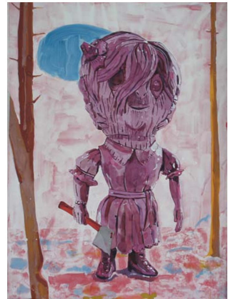
Der Holzfäller (self portrait), 2011, 152 x 111 cm, watercolor, gouache on paper

Actually, I would never call them trivial. There is a whole subculture of kaiju ("strange beast") or monster toys, mostly from Japan and the West Coast, particularly L.A. They are made of vinyl and sprayed with automotive dye paints. They are highly artistic - and not cheap either. Usually they start at $100 or so. It's a whole subculture and in L.A. relates to skaters, graffiti artists and the tattoo scene. It's popular art and very creative, often whimsical, sometimes bizarre. I actually don't know much about the scene. I don't have any of the figures, nor am I very interested in collecting them. I originally became aware of kaiju when I was researching Godzilla. Both Godzilla and Hedorah (one of his enemies) are based upon nuclear and environmental (toxic) catastrophes. Because Godzilla was too iconic I looked at other kaiju. I use exclusively photographs from the internet. Also, I like the challenge of translating the automotive paints and high gloss plastic texture into a traditional painting technique. They are contemporary cultural artifacts of a sort of subculture.