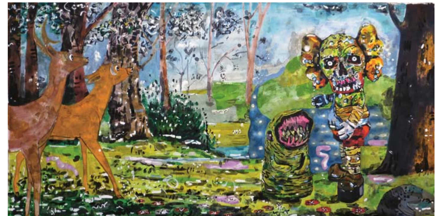
Dead Disney, 2011, 111 x 222 cm, watercolor, gouache on paper