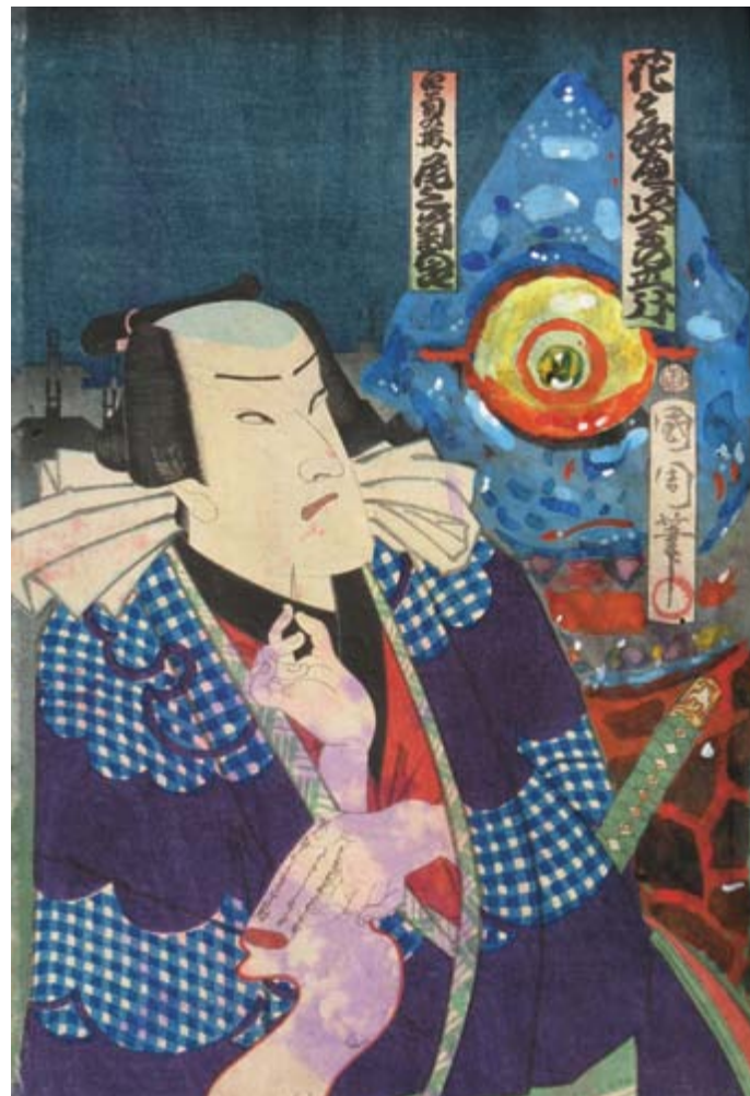
Monster Drawings 8, 2010, 36 x 23 cm, pencil, watercolor and gouache on Japanese print (Kabuki)