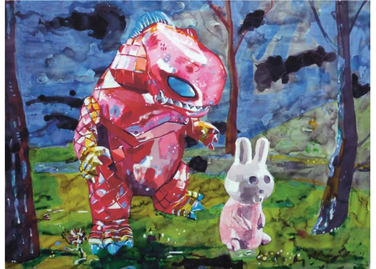
Pornohäschen, 2011, 111 x 152 cm, watercolor, gouache on paper