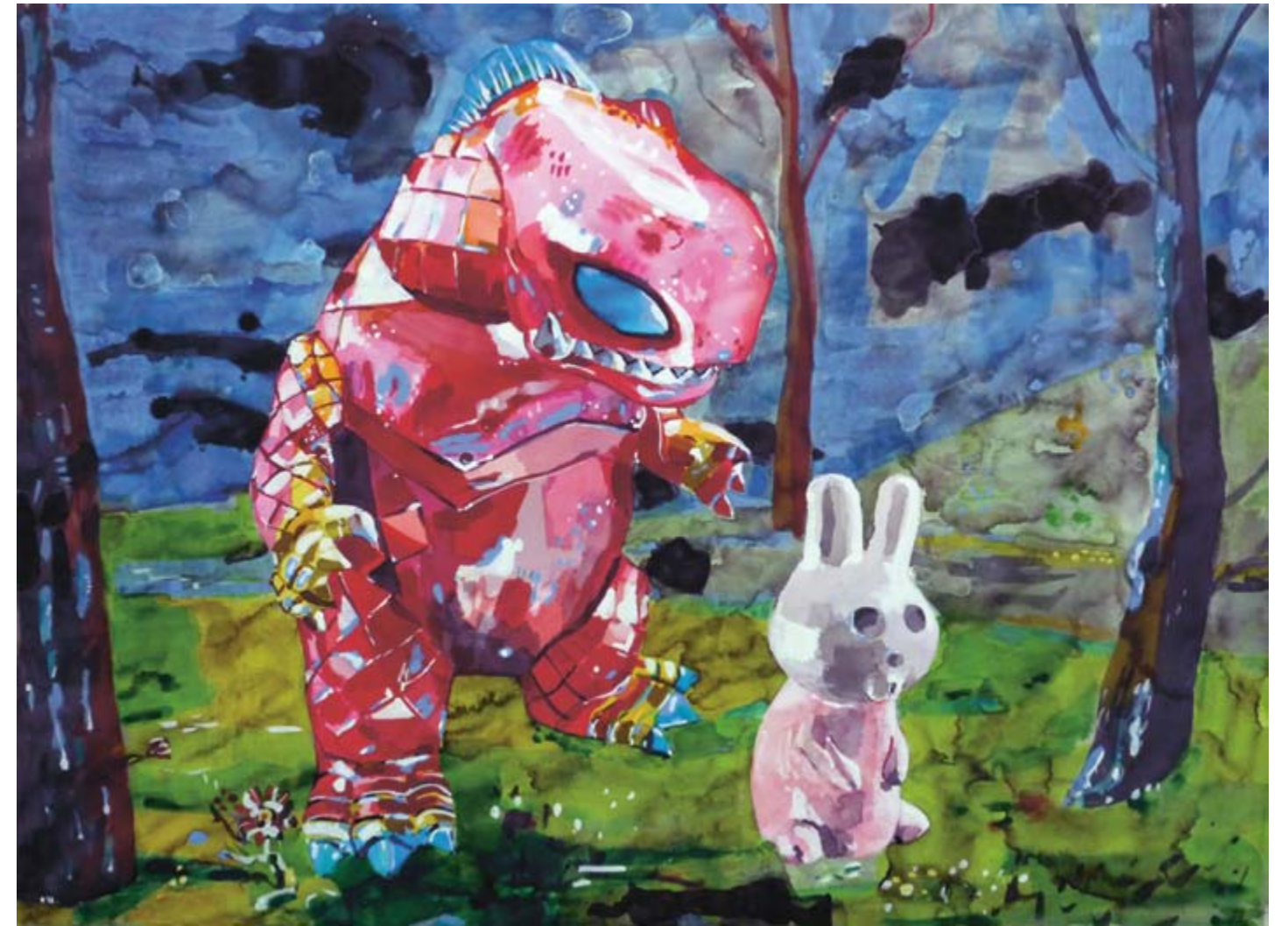
Pornohäschen, 2011, 111 x 152 cm, watercolor, gouache on paper